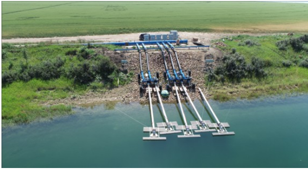
Figure 1 – Seasonal Irrigation Pump Station Mounted on Wheeled Carts within Lake Diefenbaker bed, bank and boundary.

If the irrigation intake or pump station project involves one or more ineligible activities, please contact WSA to discuss the proposal or submit an Aquatic Habitat Protection Permit application for review prior to commencing work. Please contact WSA if you need help determining if your project is eligible for this EPP.