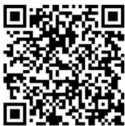
Site Isolation, Maintaining Downstream Flow, Dewatering

For low-risk activities requiring shoreline sloping, the EPP conditions laid out under section 3.2 are tailored to prevent an increase in turbidity in the water and potential contamination from using heavy machinery around water. For additional information and construction best management practices on how to temporarily isolate, consult WSA's website wsask.ca/proper-measures-for-site-isolation/ .