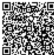
Erosion and Sediment Control

Irrigation intake and pump station activities such as trenching and burying water pipes or utility lines may cause soil disturbance, resulting in erosion of the soil and sedimentation when disturbed site areas are not appropriately stabilized before, during and after construction. Knowing how to choose, install and inspect proper temporary erosion and sediment control (ESC) measures will help proponents meet condition 3.5.3 as temporary ESC measures should be tailored to site topography, soil type and hydrology aspects associated with local runoff. Information on temporary ESC principles and recommended materials can be found on WSA's website: wsask.ca/erosion-and-sediment-control-suppliers-installers-and-designers/ .